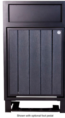
Shown with optional foot pedal